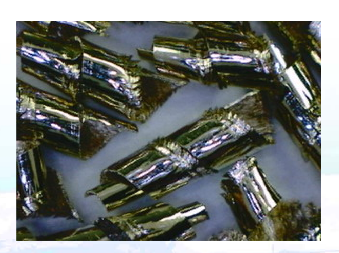
Fig.5: Sample No. 7 – Material 74 detail of chips