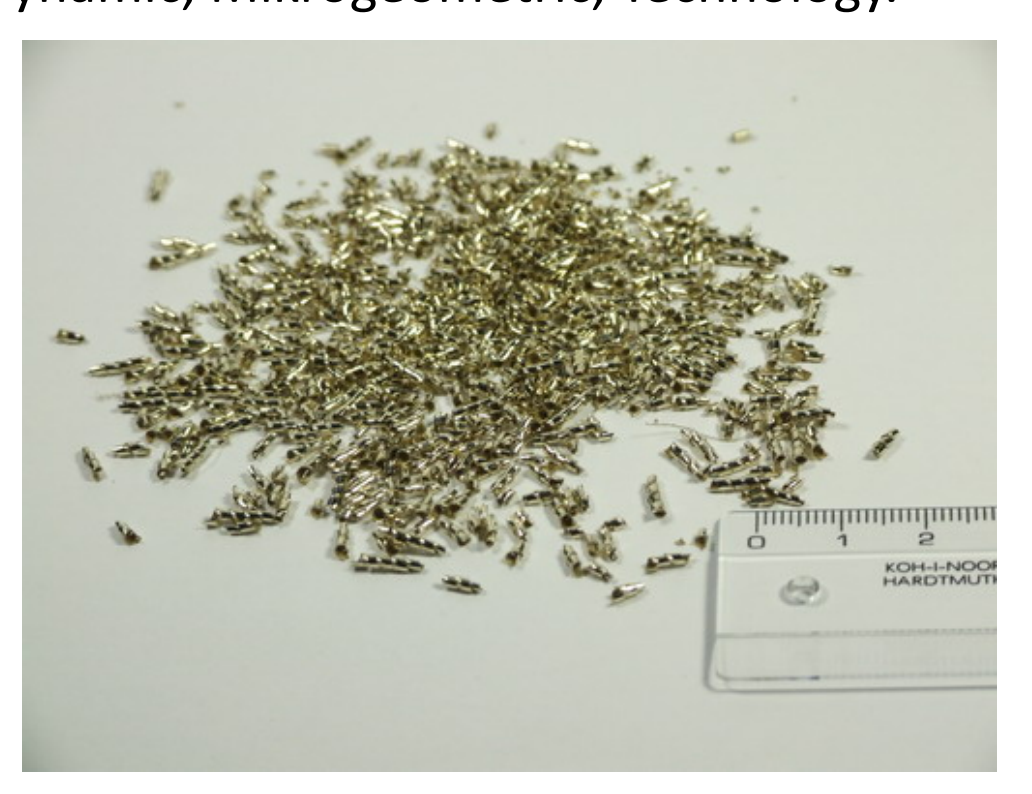
Fig.4: Sample No. 7 – Material 74 chips