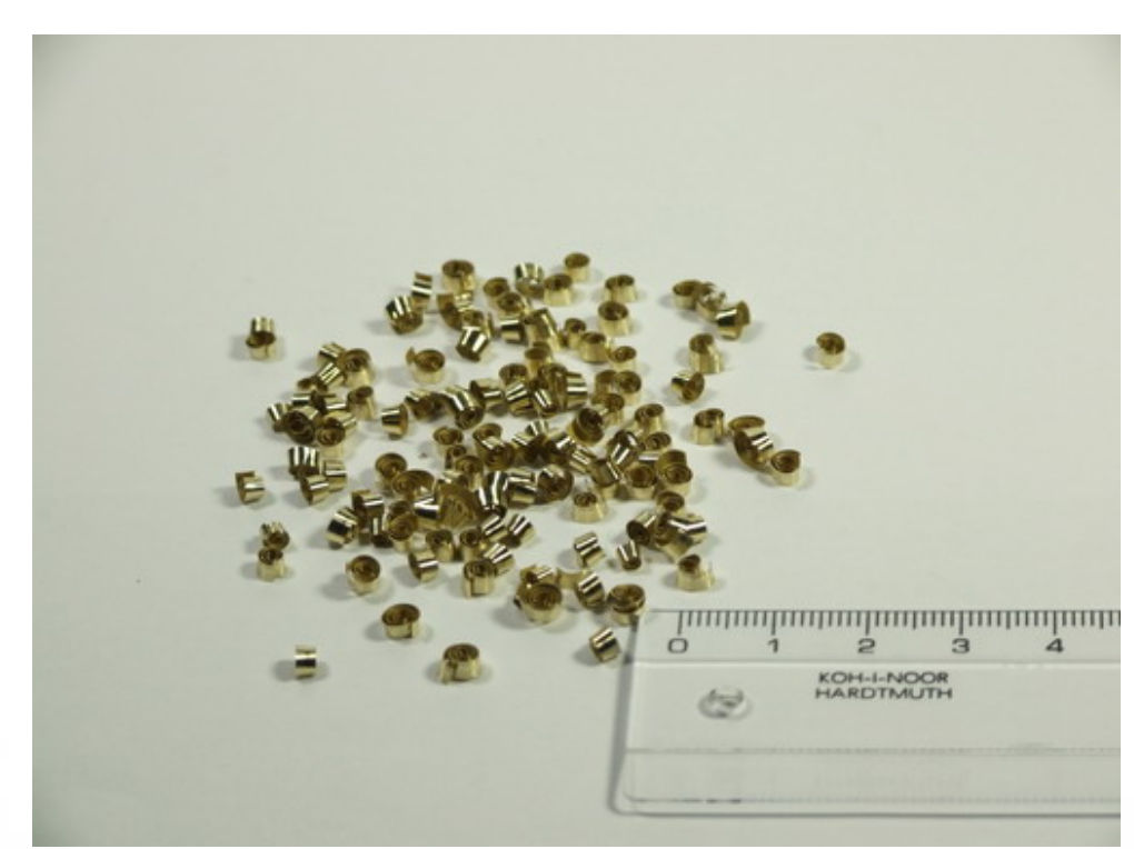
Fig.2: Sample No.24 - Material 70 chips

The climate changes are very interesting tema to solve and which is causing an increasing amount of greenhouse gases in the atmosphere.