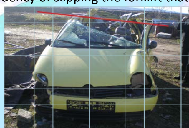
Fig.1- Damaged roof in passenger vehicle "Volkswagen Lupo" in contact

Based on the damage to the passenger vehicle "Volkswagen Lupo", it appears that the primary contact of the vehicle was left to the front part of the roof which crashed into the metal plate at the time of the accident has been raised on the forks of the forklift. Viewing from the photographs of the vehicle in the attached documentation in the previously prepared expert, the resulting shot was disassociated left front pillars in place of the junction with the roof of the vehicle, the front part of the roof was deformed up and torn from vehicle, while the rear part of the roof was suppressed down (towards the inside of the passenger compartment or the back seat). Damage to the passenger vehicle "Volkswagen Lupo" the volume and location of occurrence undoubtedly point to the conclusion that the metal tray at the point of impact was in the tilted position at an angle of 30 to 40 that has been tilted toward the asphalt surface with a tendency of slipping the forklift that was shipped